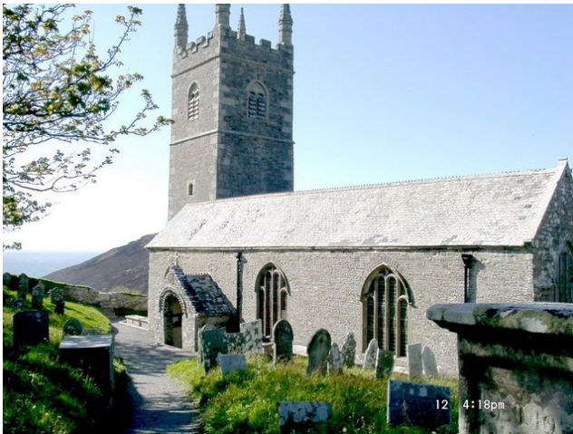
St Morwenna's, Morwenstow, birthplace of the modern harvest festival

In Britain, there was Lammas –or Loaf Mass, - the wheat harvest on 1 st August which fell out of favour after the Reformation, superseded by what we now think of as the traditional harvest festival on the Sunday nearest to the Harvest Moon in September. It was a community event and celebrations would end with the Harvest Supper or “Churn Supper,” named after the big jug of cream provided, on Michaelmas Eve. It was a thank you from the farmer to his workers for their toil over the year.