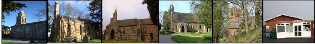
St Mary Magdalene SS Peter + Paul St Calixtus St Nicholas St Mary Magdalene St Leonards Hall Bridgnorth Tasley Astley Abbotts Oldbury Quatford Bridgnorth