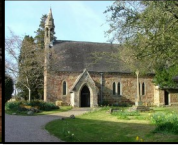
St Nicholas Oldbury