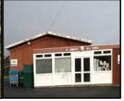
St Leonards Hall Bridgnorth