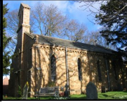
SS Peter + Paul Tasley