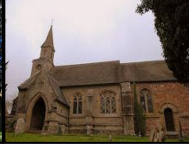
St Calixtus Astley Abbots