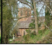
St Mary Magdalene Quatford