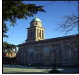
St Mary Magdalene Bridgnorth