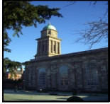
St Mary Magdalene Bridgnorth