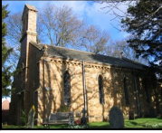
SS Peter + Paul Tasley