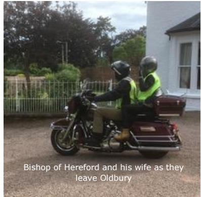
Bishop of Hereford and his wife as they leave Oldbury

the existing building, and after many frustrating but unforeseeable delays ( - who would have thought that the porcelain for the toilet suite originated in Ukraine!), the work is now complete. We were delighted by the presence of the Bishop of Hereford on the afternoon of Sunday 22 nd May at its official “First Flush”!