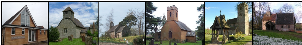
Upton Cressett St Michael's