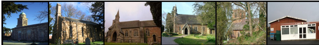
St Mary Magdalene Bridgnorth