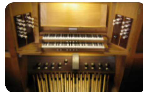
The Nicholson console before being removed from the organ chamber behind the choir stalls in the Chancel (April 2007)